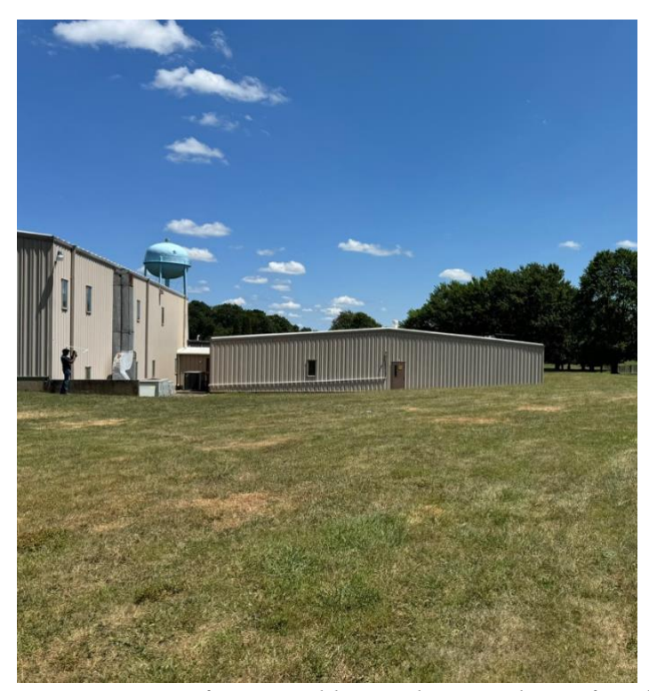
Figure 3: View of AGR Building 6 showing slope of roof