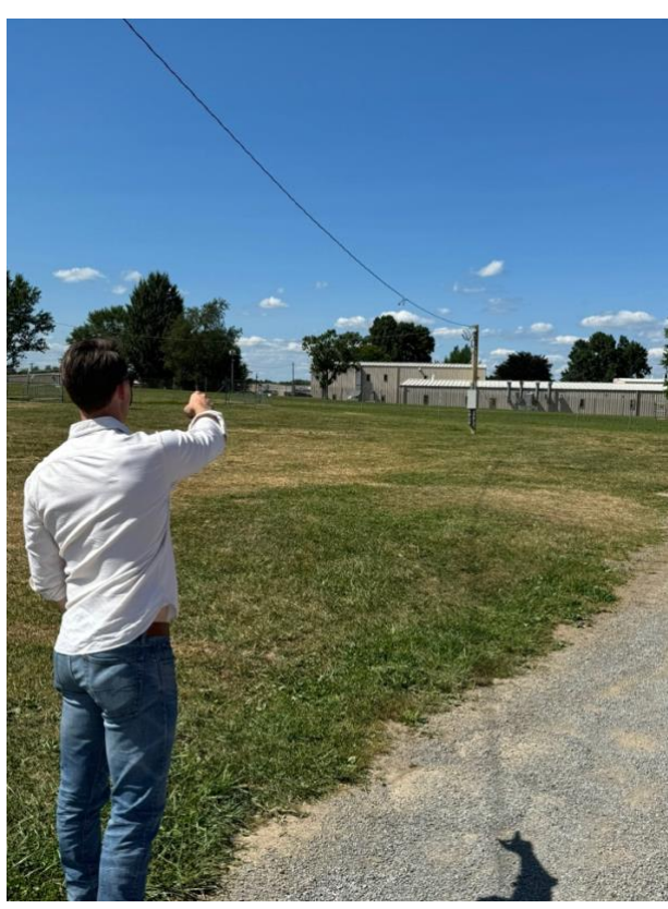
Figure 1: Senator Hawley standing at the Butler Farm Show Grounds pointing toward AGR Building 6

Senator Hawley also spoke to agents from the Federal Bureau of Investigation, who denied him access to the site and demanded that he leave.