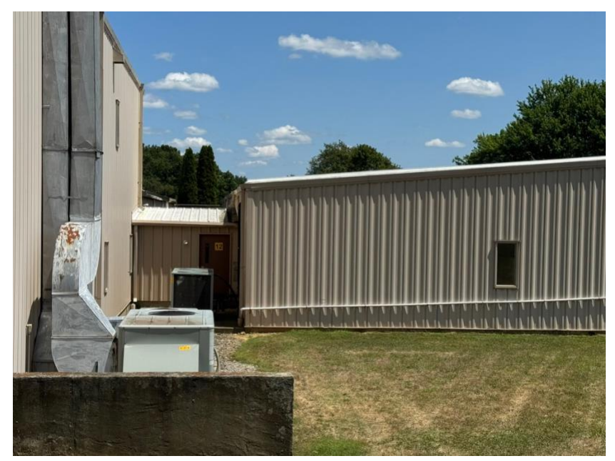
Figure 2: Ledge where Crooks was photographed by AGR Building